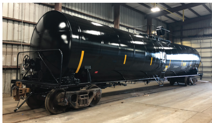
Gloss comparison at 542 QUV hours