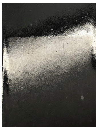
Hempatop Direct 460