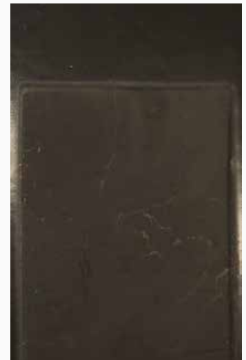
DTM commonly used in rail