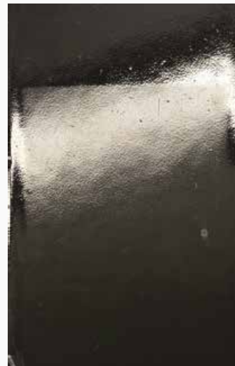
Hempatop Direct 460