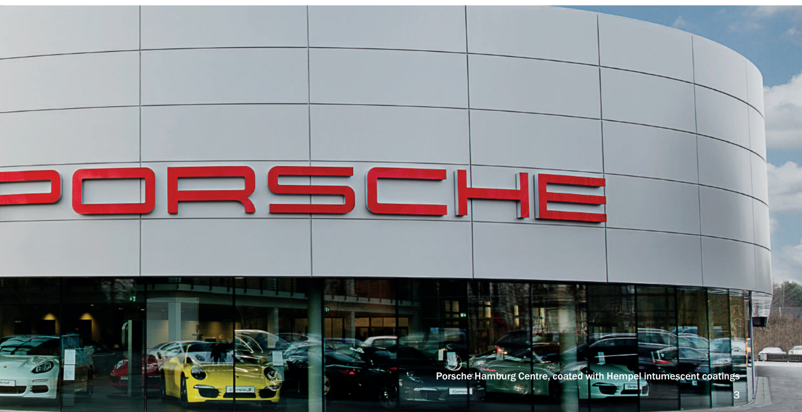
Porsche Hamburg Centre, coated with Hempel intumescent coatings

Use one product across I-sections and hollow sections. Specification and project management is simplified, especially in complex mixed structure projects and streamlined supply chain and operations.