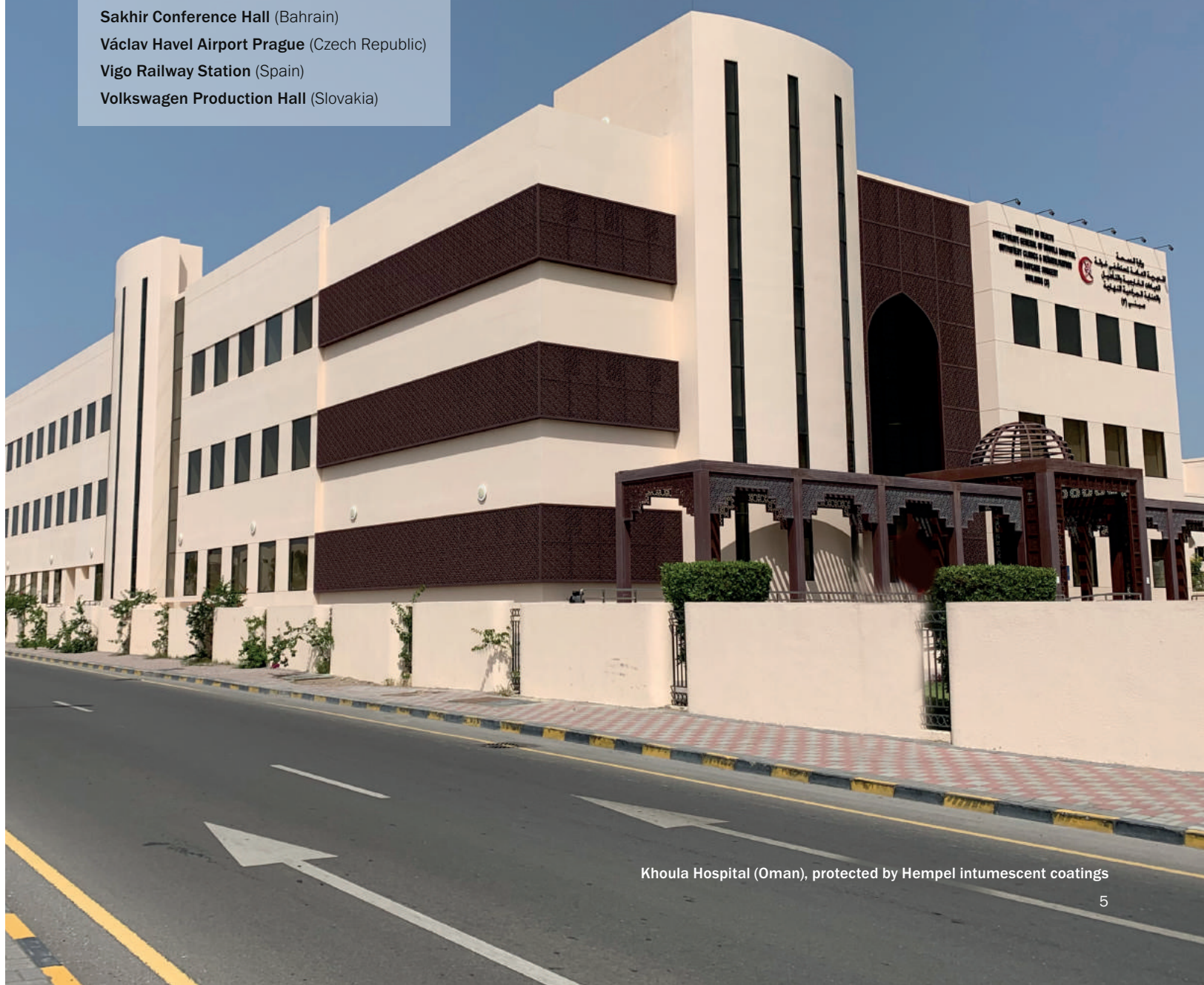
Khoula Hospital (Oman), protected by Hempel intumescent coatings

We are there every step of the way, offering advice, support and inspiration – and solutions that provide superior protection and performance.